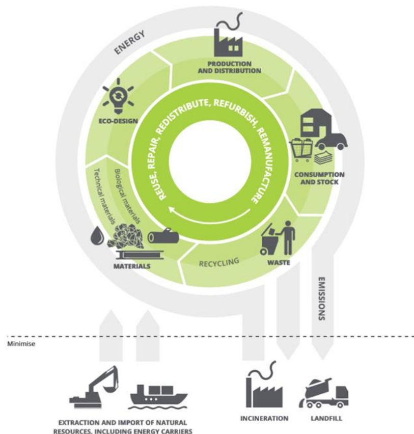
Image 18.1: A Simplified Model of the Circular Economy for Materials and Energy (European Environment Agency (EEA) 2016)

The principal objective of sustainable resource and waste management is to use resources more efficiently, where the value of products, material and resources is maintained in the economy for as long as possible such that the generation of waste is minimised. To achieve resource efficiency there is a need to move from a traditional linear economy to a circular economy (refer to Image 18.1).